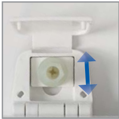
3/8" ADJUSTABLE HINGES