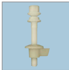
NON-CORROSIVE BOLTS AND WING NUTS