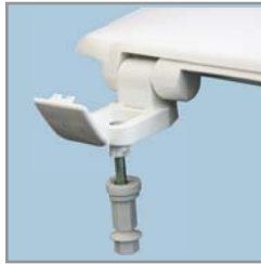
PLASTIC WHISPER•CLOSE® HINGES