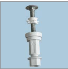
STA-TITE® SEAT FASTENING SYSTEM™