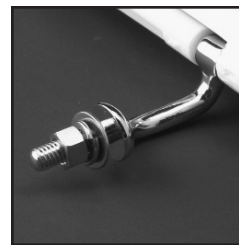
CHROME-PLATED BRASS HINGE

Ring thickness is 11/16" Ring thickness including the bumper is 1" Height of the seat with cover is 1-1/2"