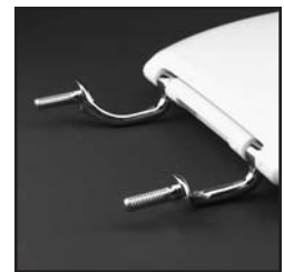
7" CENTERS BOLT INTO TANK ADAPTED FOR THE CASE 1100