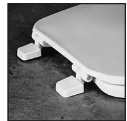
"LOCKED-IN" TOP-TITE® HINGE