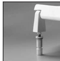
STA-TITE ® , COMMERCIAL FASTENING SYSTEM ™ , ONE-PIECE INTEGRATED NUT AND WASHER