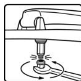
Using wrench, tighten until lower portion shears off.