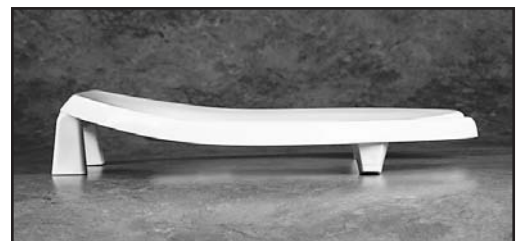
ADDITIONAL 2" OF HEIGHT