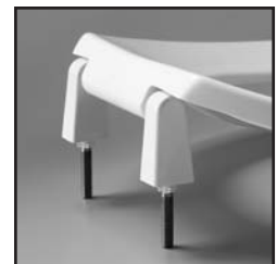
EXTERNAL CHECK HINGE WITH 300 SERIES STAINLESS STEEL BOLTS