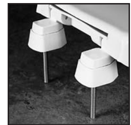
300 SERIES STAINLESS STEEL HINGES