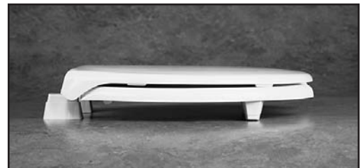
ADDITIONAL 2" OF HEIGHT