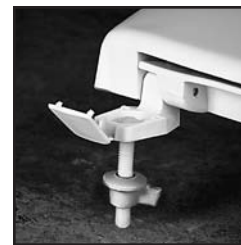
TOP-TITE® HINGES FEATURE NO-SLIP WASHER

Ring thickness is 3/4" Ring thickness including the bumper is 1-1/16" Height of the seat with cover is 2-1/4"