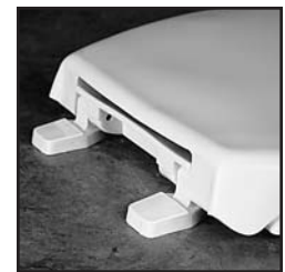
“LOCKED-IN” TOP-TITE® HINGE