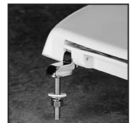
300 SERIES STAINLESS STEEL SELF-SUSTAINING HINGE