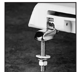
300 SERIES STAINLESS STEEL SELF-SUSTAINING HINGE