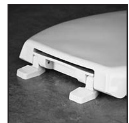
"LOCKED-IN" TOP-TITE® HINGE