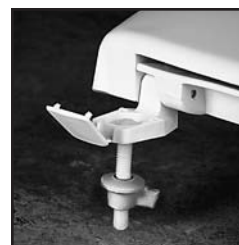
TOP-TITE® HINGES FEATURE NO-SLIP WASHER

Ring thickness is 3/4" Ring thickness including the bumper is 1-1/16" Height of the seat with cover is 2-1/4"