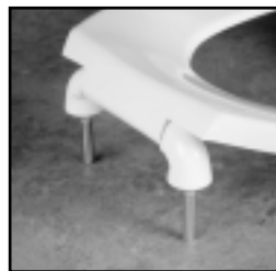
EXTERNAL CHECK HINGE