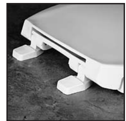
"LOCKED-IN" TOP-TITE® HINGE