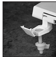
TOP-TITE® HINGES FEATURE NO-SLIP WASHER

Ring thickness is 5/8" Ring thickness including the bumper is 7/8" Height of the seat with cover is 1-7/8"