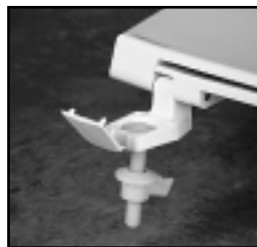
TOP-TITE® HINGES FEATURE NO-SLIP WASHER