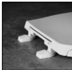
“LOCKED-IN” TOP-TITE® HINGE

Ring thickness is 5/8" Ring thickness including the bumper is 7/8" Height of the seat with cover is 1-7/8"