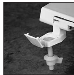
TOP-TITE® HINGES WITH BOLT AND WING NUT

Ring thickness is 3/8" Ring thickness including the bumper is 5/8" Height of the seat with cover is 1-1/2"