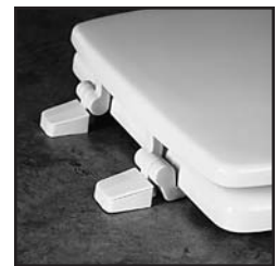
LOCKED-IN TOP-TITE® HINGE