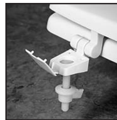
TOP-TITE® HINGES WITH BOLT AND WING NUT

Ring thickness is 13/16" Ring thickness including the bumper is 1-1/16" Height of the seat with cover is 2-5/16"