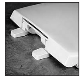
"LOCKED-IN" TOP-TITE® HINGE