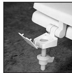
TOP-TITE® HINGES WITH BOLT AND WING NUT

Ring thickness is 3/4" Ring thickness including the bumper is 1-1/16" Height of the seat with cover is 2-5/16"