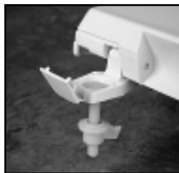
TOP-TITE® HINGES FEATURE NO-SLIP WASHER