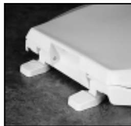
"LOCKED-IN" TOP-TITE® HINGE

Ring thickness is \frac{13}{16} " Ring thickness including the bumper is 1\frac{1}{16} " Height of the seat with cover is 2\frac{5}{16} "