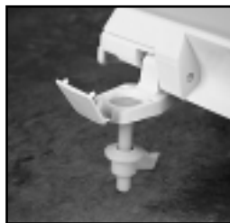
TOP-TITE® HINGES FEATURE NO-SLIP WASHER