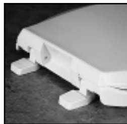
"LOCKED-IN" TOP-TITE® HINGE

Ring thickness is \frac{13}{16} " Ring thickness including the bumper is 1\text{-}\frac{1}{16} " Height of the seat with cover is 2\text{-}\frac{5}{16} "